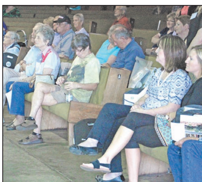
A view from inside the Anderson Music Hall in Hiawassee during the Blue Ridge Mountain EMC 2016 Annual Membership Meeting.