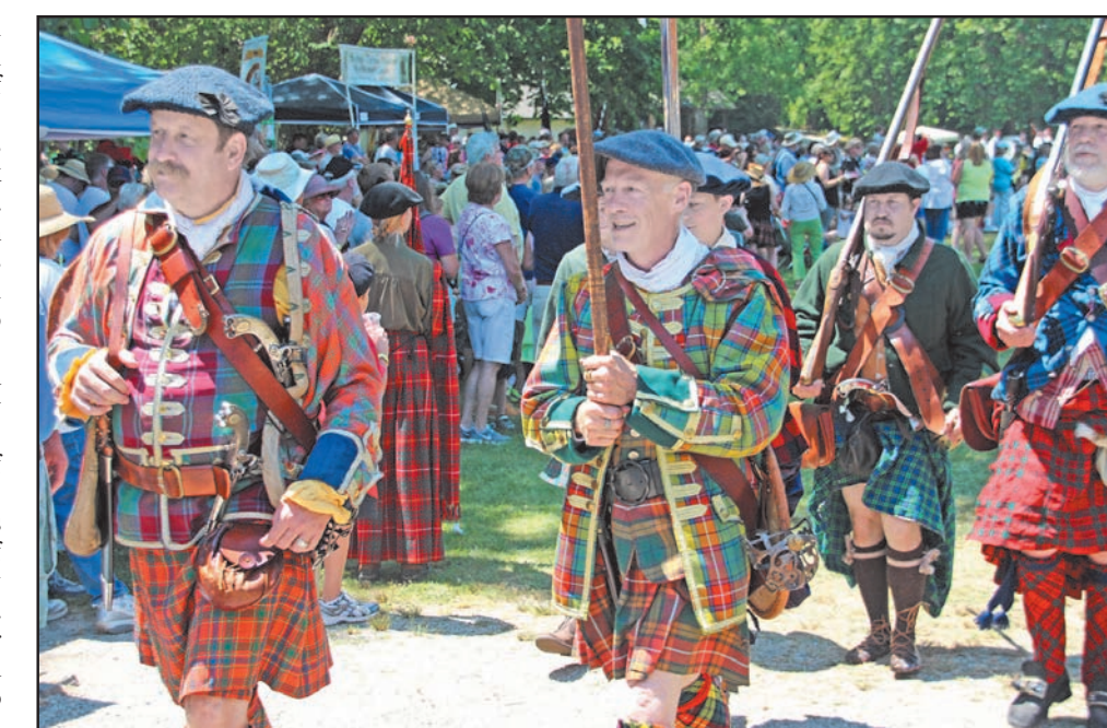
Parade of Tartans at the 2016 Blairsville Scottish Festival.